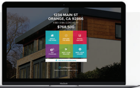
Single Property Websites

Proven lead generation tools built right into your marketing