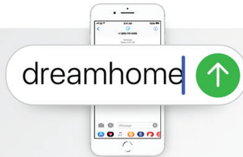
Text-to-Lead Short Codes