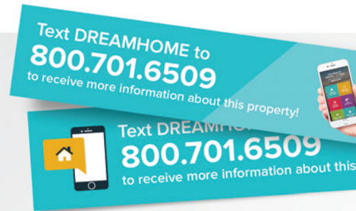
Reusable Sign Riders

It gets better though! You'll automatically be sent a 25-piece marketing kit as soon as your listings hit the MLS. Just sign up and pair with any lender. You can also get complete marketing kits for any U.S. listing in about one business hour .