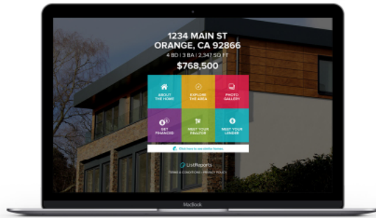
Single Property Websites