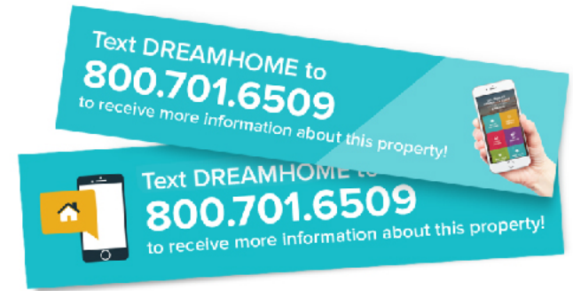
Reusable Sign Riders